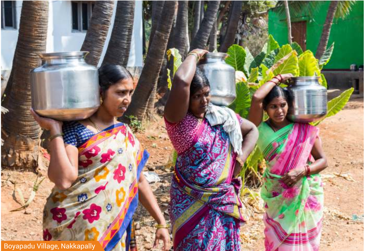
Boyapadu Village, Nakkapally

Water is essential for the survival of all life forms on this planet and it is increasingly being seen as a human right. Besides being critical to human health, access to water impacts productivity at individual, agricultural and industrial levels.