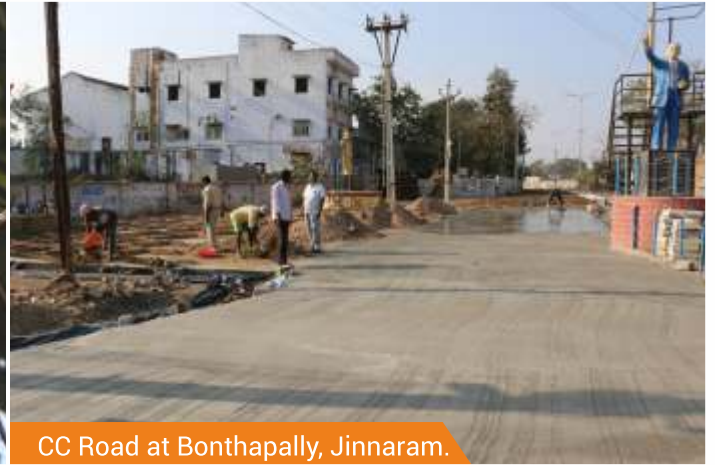
CC Road at Bonthapally, Jinnaram.