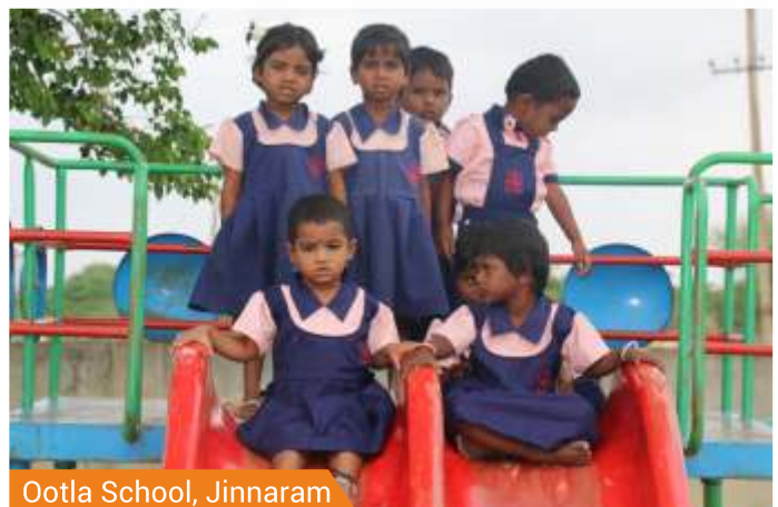
Ootla School, Jinnaram

Apart from the above, Hetero has financed the construction of a compound wall Gundlagadda Thanda Primary School & ZPHS Veliminedu schools respectively.