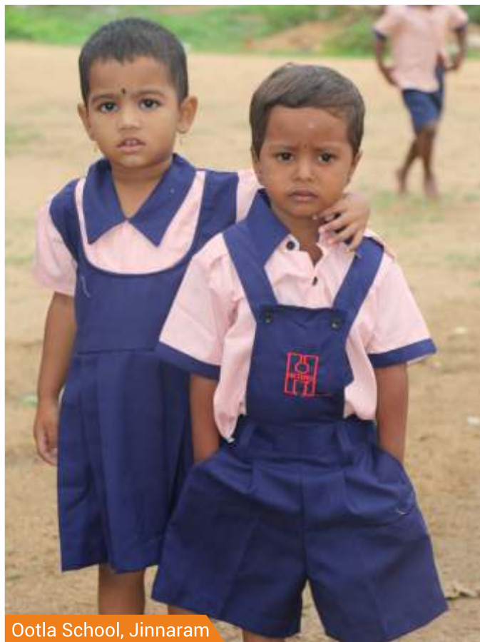
Ootla School, Jinnaram

As on date, a total of 92,642 students from 323 and 68 Educational Institutions from Khammam and Siddipet Districts respectively got benefitted by the programmes.