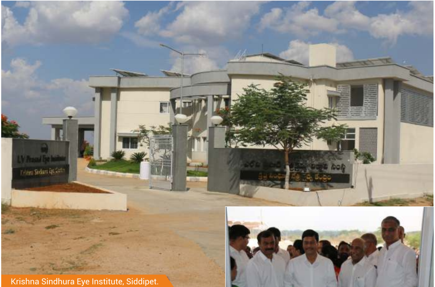
Krishna Sindhura Eye Institute, Siddipet.