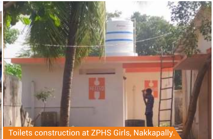
Toilets construction at ZPHS Girls, Nakkapally.

Swachh Bharat mission is by far the most massive campaign by Government of India that drew attention to the aspect of cleanliness in daily life. The campaign launched and led by the Prime Minister of India himself in 2014 captured the imagination of people from all corners of the country.