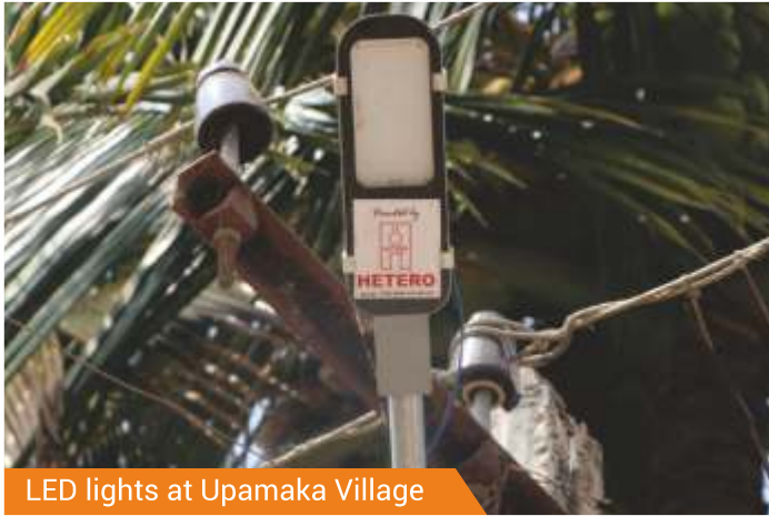
LED lights at Upamaka Village