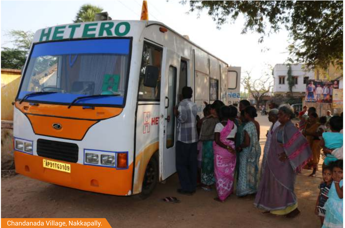
Chandanada Village, Nakkapally.

The sphere of primary healthcare is a vital aspect of a country's health system which immensely contributes to the socio-economic development of the community. The villages bordering our facilities are generally devoid of access to quality healthcare professionals and facilities owing to their isolated locations and lack of transportation among others.